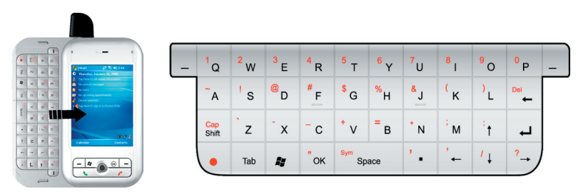
The QWERTY keyboard

Your device provides you with a QWERTY keyboard, which is similar to a standard keyboard on your PC. To use the hardware keyboard, slide the main screen rightward to reveal the keyboard.