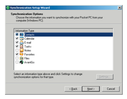
Synchronization Setup Wizard

To set up a partnership between the device and the PC, turn on your device. When the PC detects a USB connection, it starts the ActiveSync Synchronization Setup Wizard . Follow the instructions on the screen and select the Outlook items you want to synchronize.